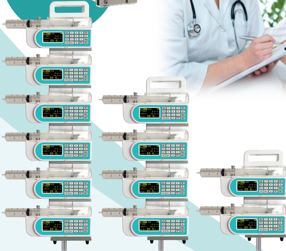
6 syringe infusion station